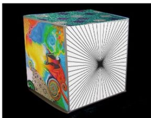
Elements of Art Cube Project

Line, colour, shape, texture, space, form, value.